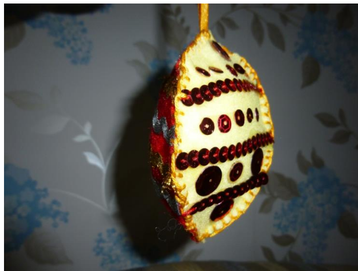
The finished Christmas Bauble